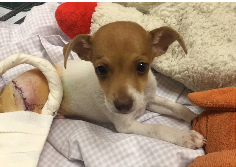
Stitches, adopted 2015